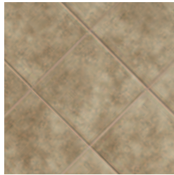
AV114 Grand Canyon