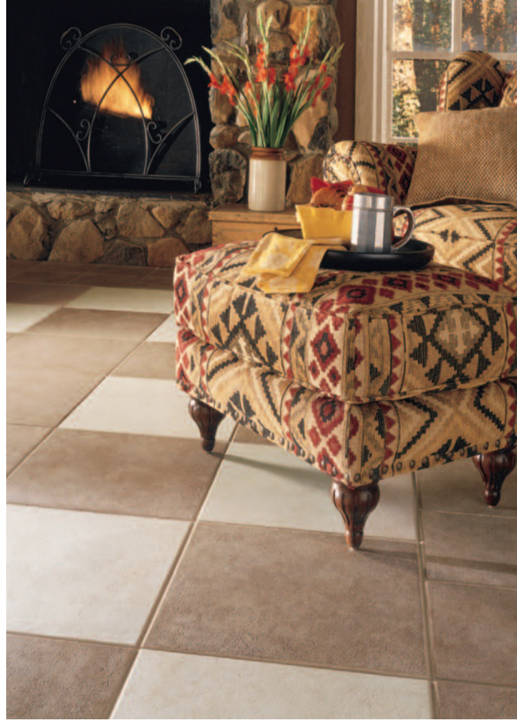
Product featured in photo above: Monticello AV111 18"x 18", Grand Canyon AV114 12"x 12", 18"x 18"