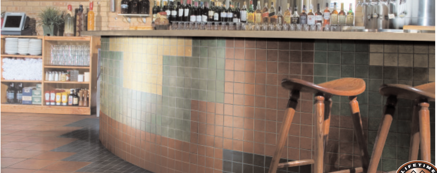
Product featured photo above: Bar Front: Color Blox 3" x 3" Mosaics – A1102 Roasted Marshmallow, A1111 A Day at the Beach, A1116 Caboose, A1119 Night Night Floor: Color Blox 12" x 12" – A1116 Caboose and Color Blox 3" x 3" Mosaics – A1119 Night Night