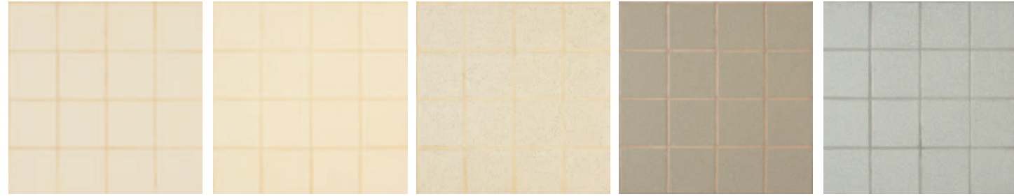
A215 Empress White