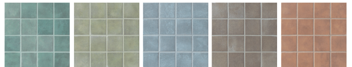
A1111 A Day at the Beach