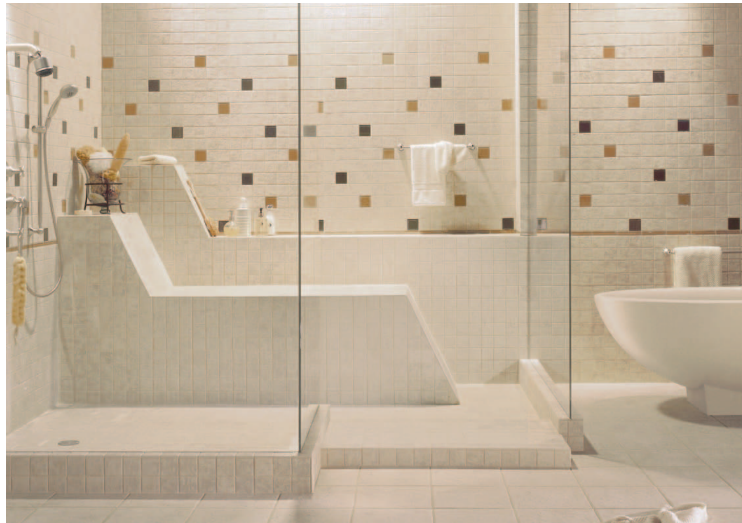
Product featured photo above: Wall – Milestone Mosaics – AV91 Moonrock / Glass Inserts – IG10 Topaz, IG18 Pewter / Glass Liner – IG10 Topaz Shower Floor – Classic Mosaics – AV91 Moonrock Bathroom Floor – Americana – AV112 Gold Rush