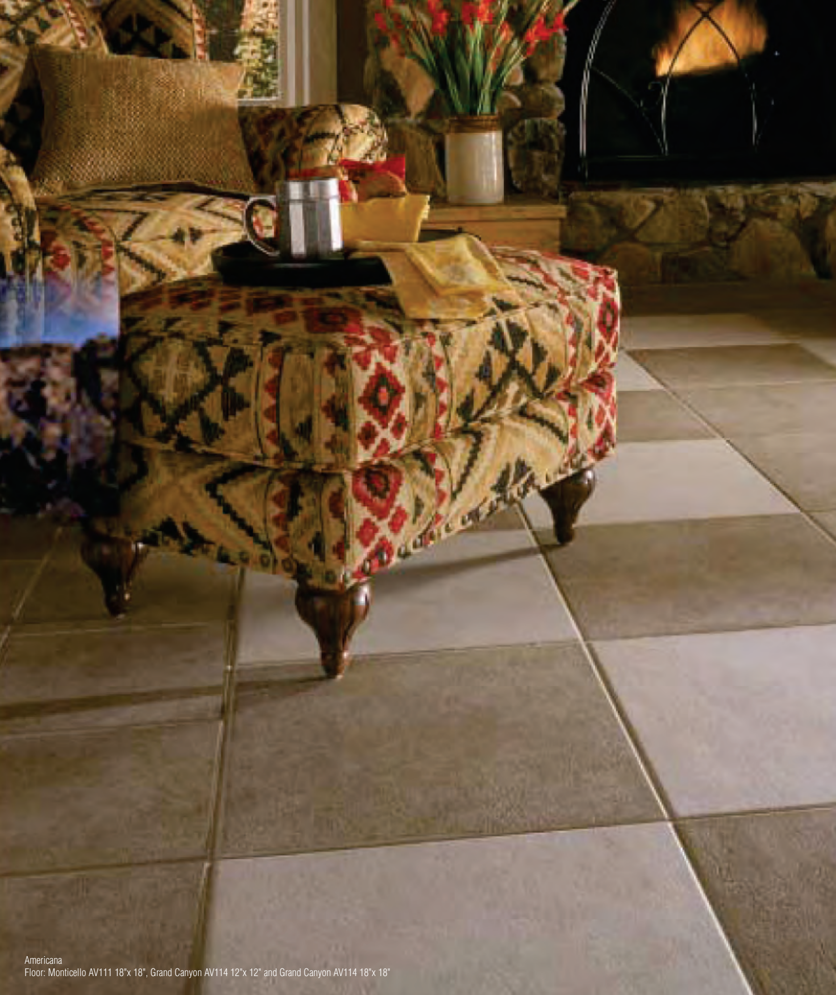
Americana Floor: Monticello AV111 18"x 18", Grand Canyon AV114 12"x 12" and Grand Canyon AV114 18"x 18"

Crossville, Inc. • P.O. Box 1168, Crossville TN 38557 Phone: 931.484.2110 • Fax: 931.456.2956 E-mail: crossc@crossvilleinc.com • www.crossvilleinc.com