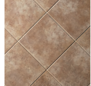
AV114 Grand Canyon