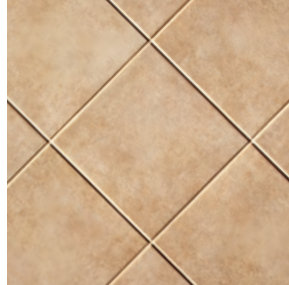
AV112 Gold Rush