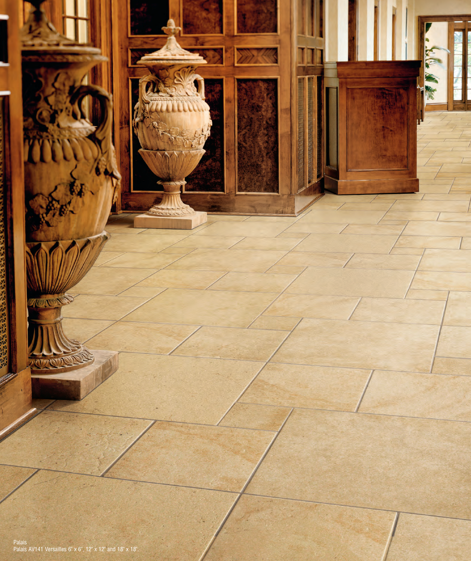
Palais Palais AV141 Versailles 6" x 6", 12" x 12" and 18" x 18".

Crossville, Inc. • P.O. Box 1168, Crossville TN 38557 Phone: 931.484.2110 • Fax: 931.456.2956 E-mail: crossc@crossvilleinc.com • www.crossvilleinc.com