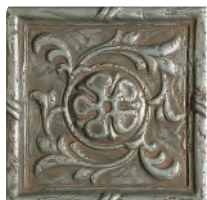
Deco Tile MT117 6' x 6'