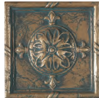
Deco Tile MT158 6' x 6'