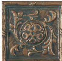
Deco Tile MT157 6' x 6'