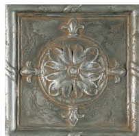
Deco Tile MT116 6' x 6'