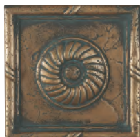
Deco Tile MT156 6' x 6'