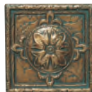
Deco Tile MT159 4' x 4'