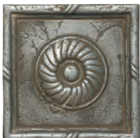
Deco Tile MT118 6' x 6'