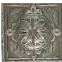
Deco Tile MT119 4' x 4'