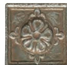
Deco Tile MT121 4' x 4'