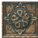
Deco Tile MT161 4' x 4'