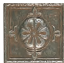
Deco Tile MT120 4' x 4'