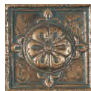
Deco Tile MT160 4' x 4'