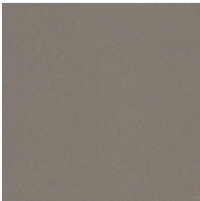
B110 Antico Taupe PO/UPS