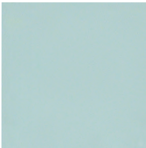
B210 Seabreeze PO/UPS