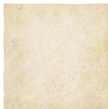
12" x 12"