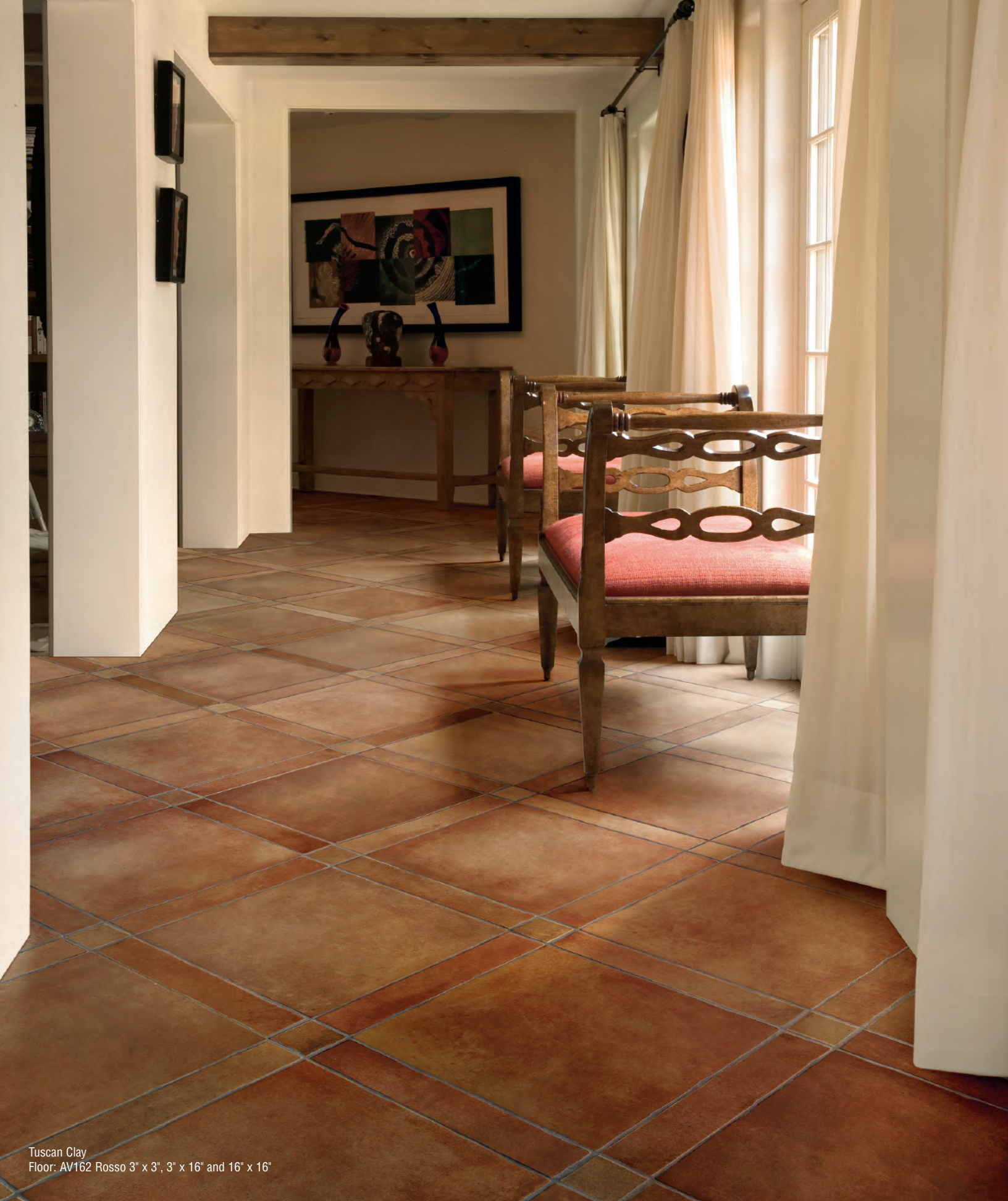
Tuscan Clay Floor: AV162 Rosso 3" x 3", 3" x 16" and 16" x 16"

Crossville, Inc. • P.O. Box 1168, Crossville TN 38557 Phone: 931.484.2110 • Fax: 931.456.2956 E-mail: crossc@crossvilleinc.com • www.crossvilleinc.com