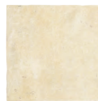
8" x 8"