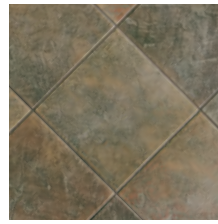
Taupe Mist AV133