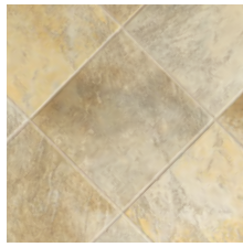
Autumn Sun AV132