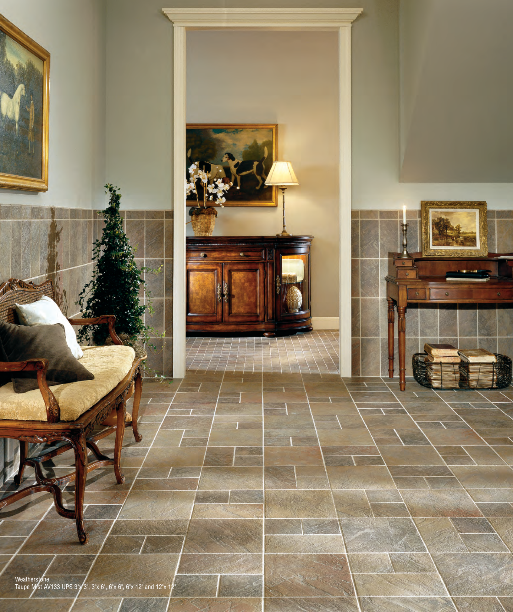
Weatherstone Taupe Mist AV133 UPS 3'x 3', 3'x 6', 6'x 6", 6'x 12" and 12'x 12"

Crossville, Inc. • P.O. Box 1168, Crossville TN 38557 Phone: 931.484.2110 • Fax: 931.456.2956 E-mail: crossc@crossvilleinc.com • www.crossvilleinc.com