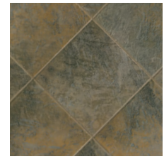
Midnite Storm AV135