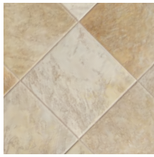
Summer Cloud AV131