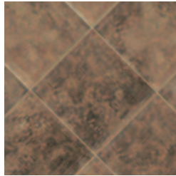
VS55 Lava Brown