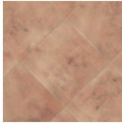
VS53 Etruscan Clay