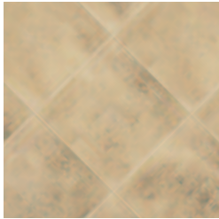
VS51 Pietra Vecchia