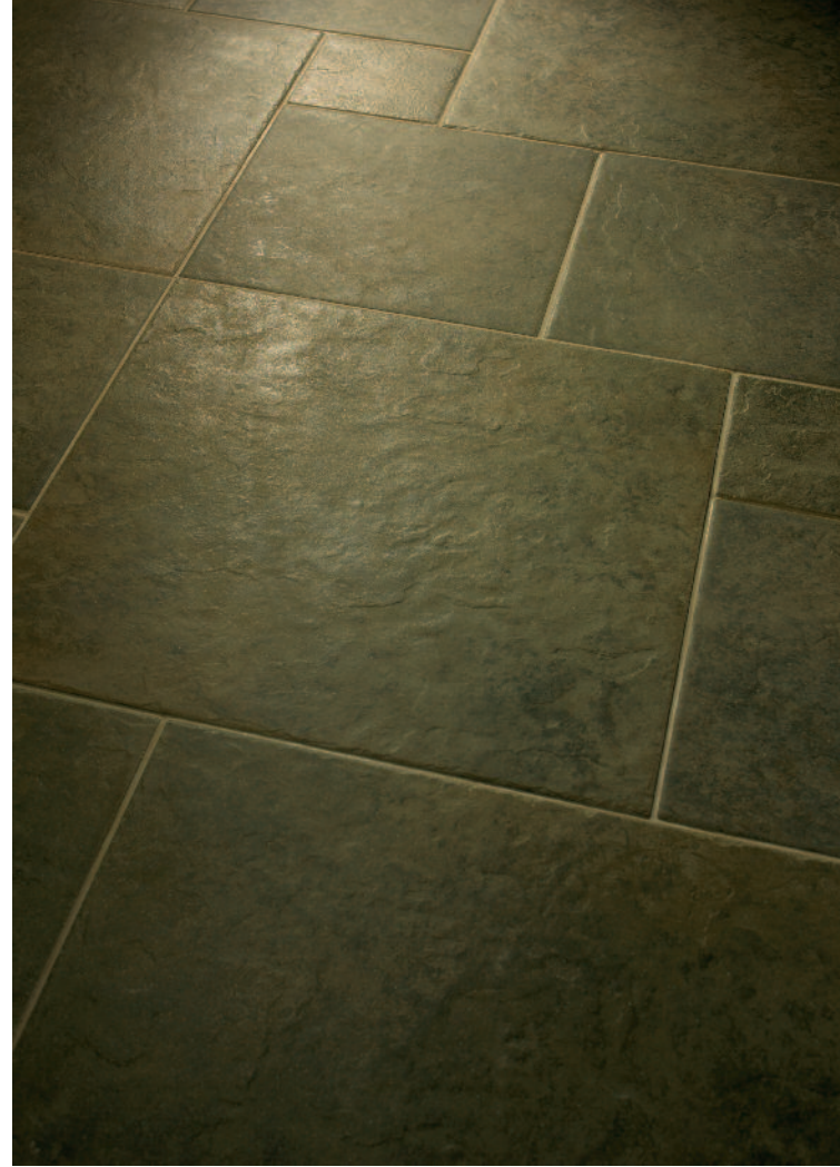
Product featured in photo above: Apollo Bronze VS54 6"x 6", 12"x 12", 18"x 18"