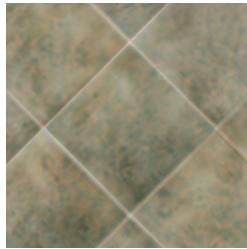
VS54 Apollo Bronze