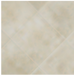
VS52 Antico Silver